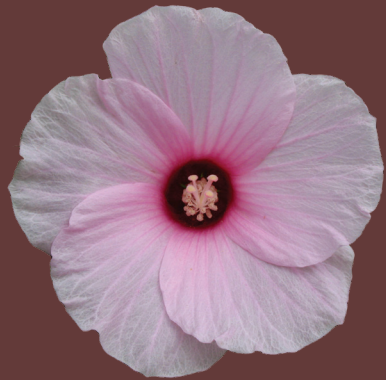
Halberd-leaved hibiscus - Hibiscus laevis

Most of these remarkable blooms are found in our open meadows and wetlands, where the plants have been able to soak up sunlight throughout the long summer days, often growing to tremendous heights.