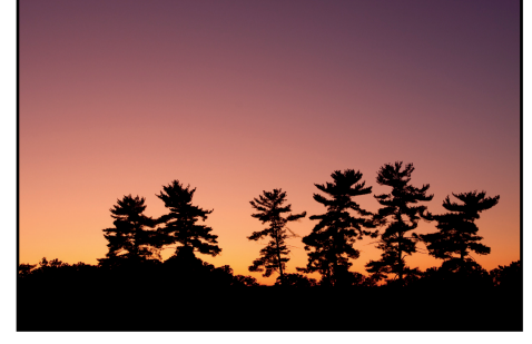
The Arboretum's conifer collection includes one-third of the world's pine species.