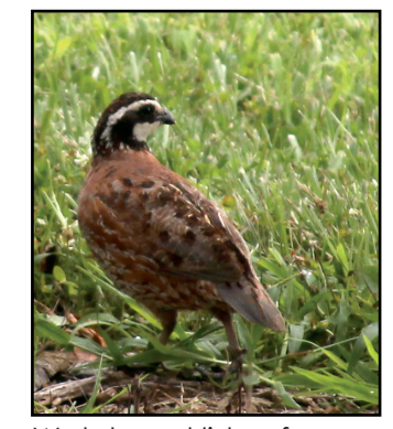
Watch and listen for bobwhite quail in the native plant meadow.