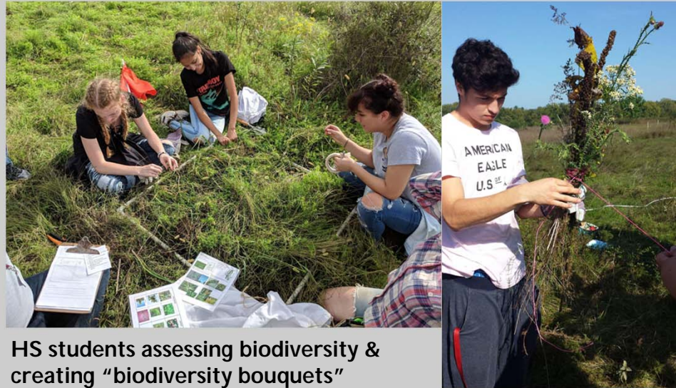
HS students assessing biodiversity & creating "biodiversity bouquets"