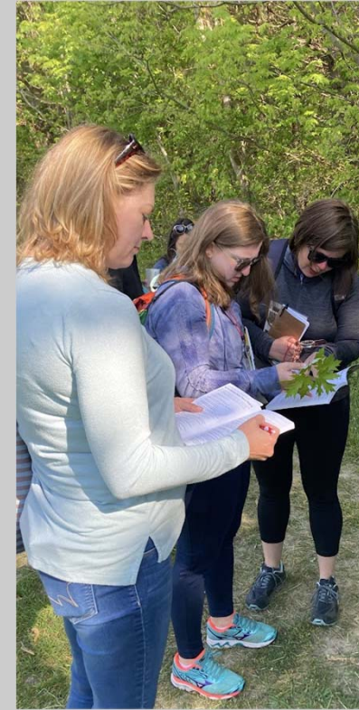
Teachers learning how to identify trees