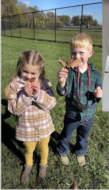
1st graders observing & recording leaf characteristics