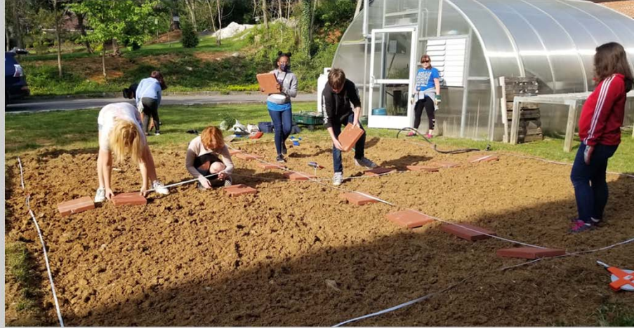
7th graders measuring, laying out, & planting a pollination garden