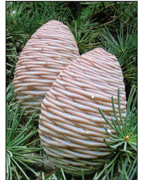
Cedar of Lebanon Cones

State Arboretum of Virginia At the University of Virginia's Historic Blandy Experimental Farm