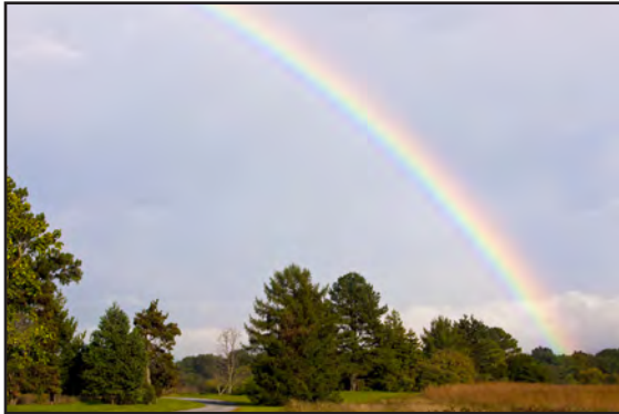
Choose a trail and start walking! This photo was taken along the Maple Trail.

Find the trail that's right for you and start walking!