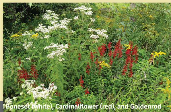
Boneset (white), Cardinalflower (red), and Goldenrod

Hummingbirds, butterflies, wasps, and migrating birds are just some of the wildlife you'll see visiting our plants during this busy season.