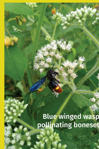
Blue winged wasp pollinating boneset

New York Ironweed ( Vernonia noveboracensis ) - Thriving in wetlands and wet meadows, this plant is a key resource for many species of butterflies. It is a host plant for painted lady butterflies, and tiger swallowtails regularly feed on its nectar.