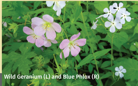
Wild Geranium (L) and Blue Phlox (R)

In our open spaces, warm season plants are often still dormant or just waking up as migratory birds begin to arrive for the breeding season.